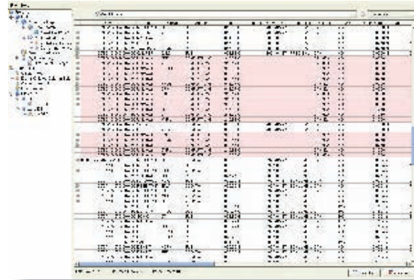
View curves from multiple sources.

IHS has more curves than any other company can offer.